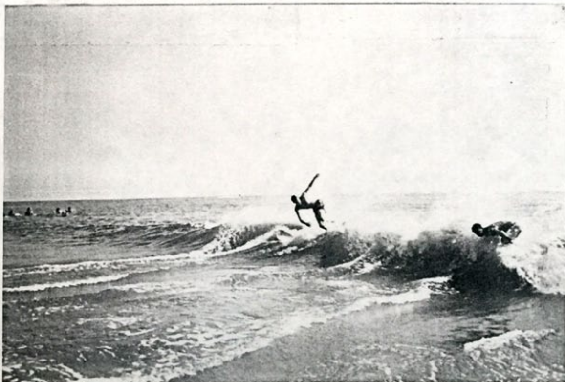
(Above) Jeff Green (left) challenges east coast champion Chuck Stapleford for this wave, during the 1990 East Coast Skimboarding Championships.